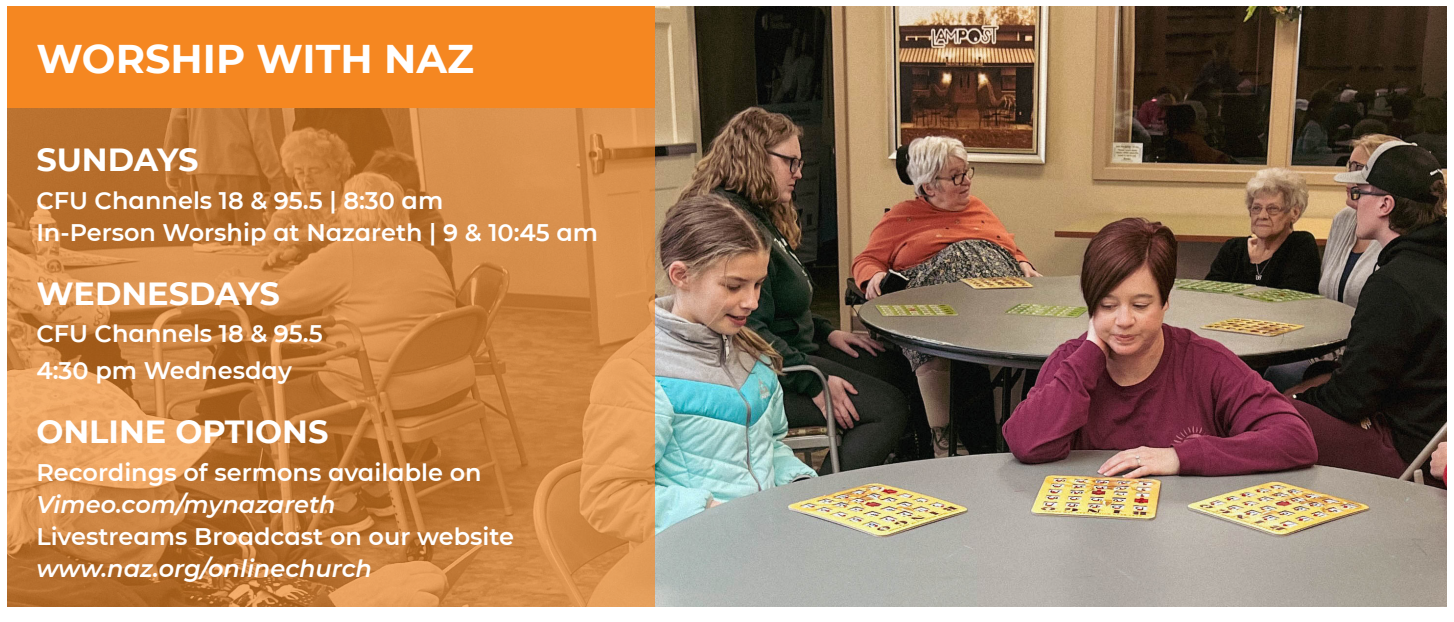
POW (Parents on Wednesdays) and New Aldaya Bingo